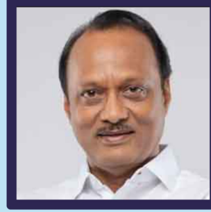
Shri. Ajit Pawar