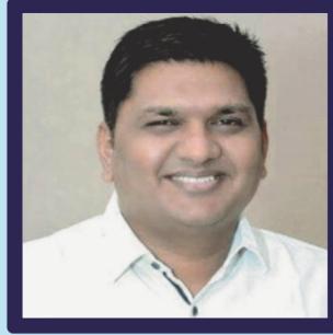
Shri. Prajakt Tanpure

Hon'ble Minister Higher & Technical Education