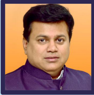
Shri. Uday Samant

Hon'ble Minister Higher & Technical Education