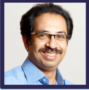
Shri. Uddhav Thackeray